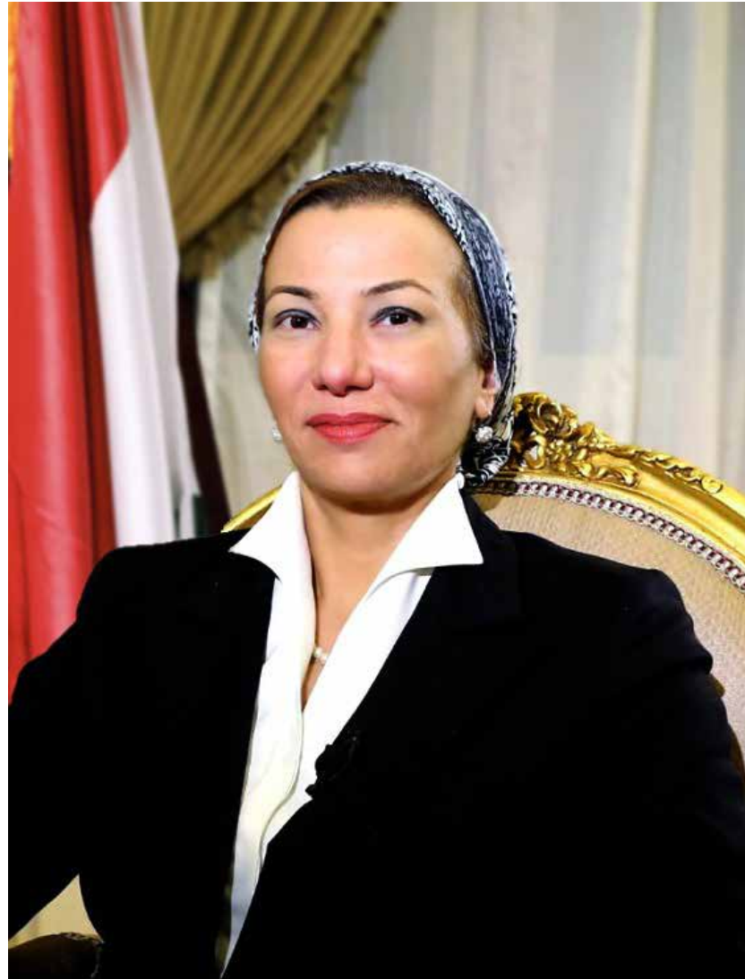
MINISTER OF ENVIRONMENT, H.E. DR. YASMINE FOUAD

Therefore, a recent decision was taken to prepare the first comprehensive national climate change strategy – 2050, which lays down the directions and policies to be adopted by the country to fulfil its aspirations for its climate action. The strategy includes five main goals (a) achieving sustainable economic growth and low-emission development in various sectors, (b) enhancing adaptive capacity and resilience to climate change, and alleviating the associated negative impacts, (c) enhancing climate change action governance, (d) enhancing climate financing infrastructure, and (e) enhancing scientific research, technology transfer, knowledge management and awareness to combat climate change.